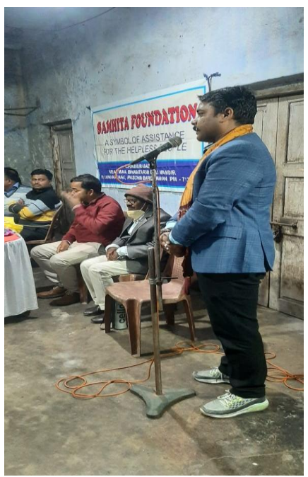
Awareness for Sustainable Development