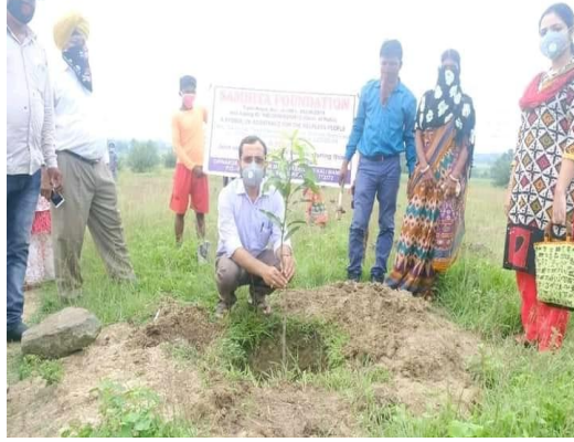
Mango Tree Plantation