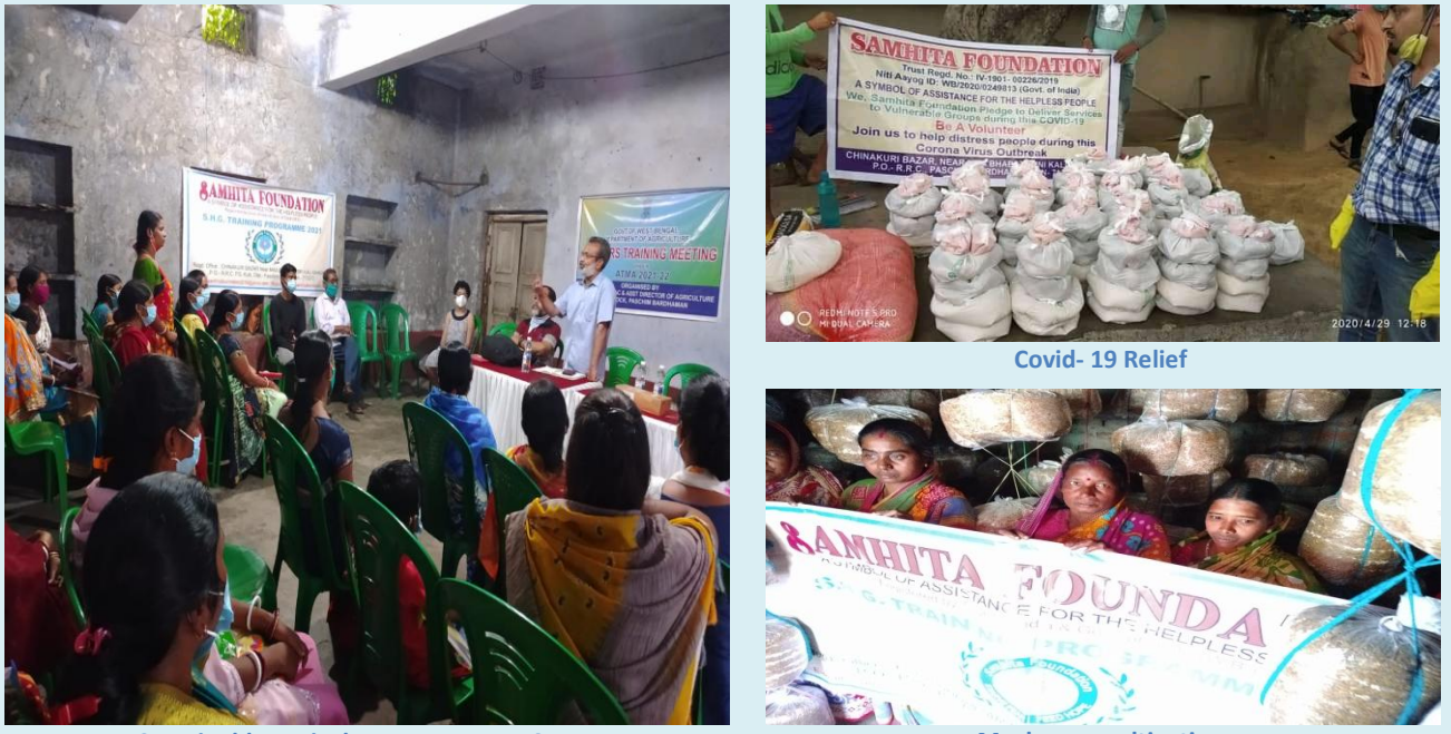
Sustainable Agriculture Awareness Camp