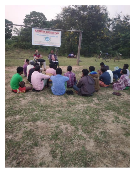
Motivational Programme on Self Employment